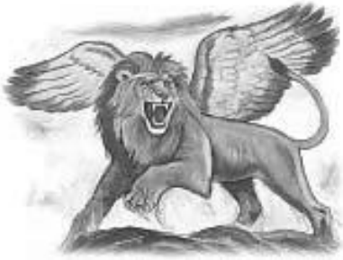
LION w/EAGLE WINGS