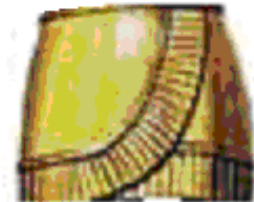
“The King of Greece” (8:21)