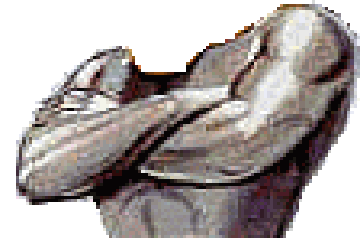
“The Medes & Persians” (5:28; 6:28, 8:20)